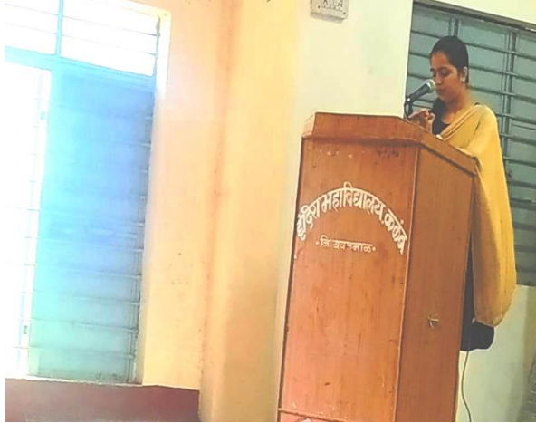
A poetry delivered by the student