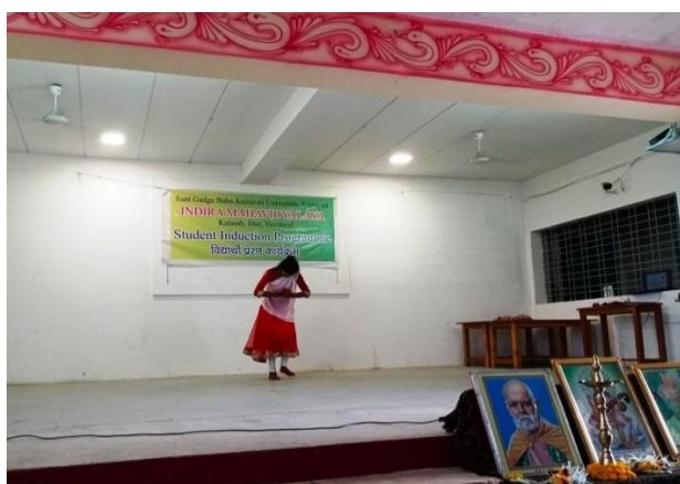
Solo dance by student