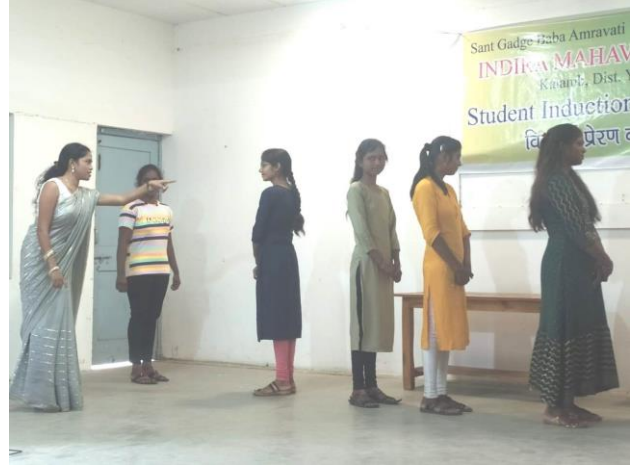
Communication game perform by the students