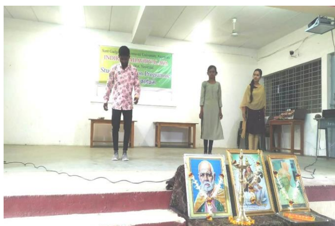
An act perform by the students